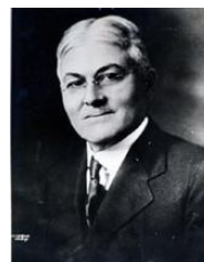
George W. Crile Sr., MD

To learn more about its history and centennial celebration planned this year, visit clevelandclinic.org .