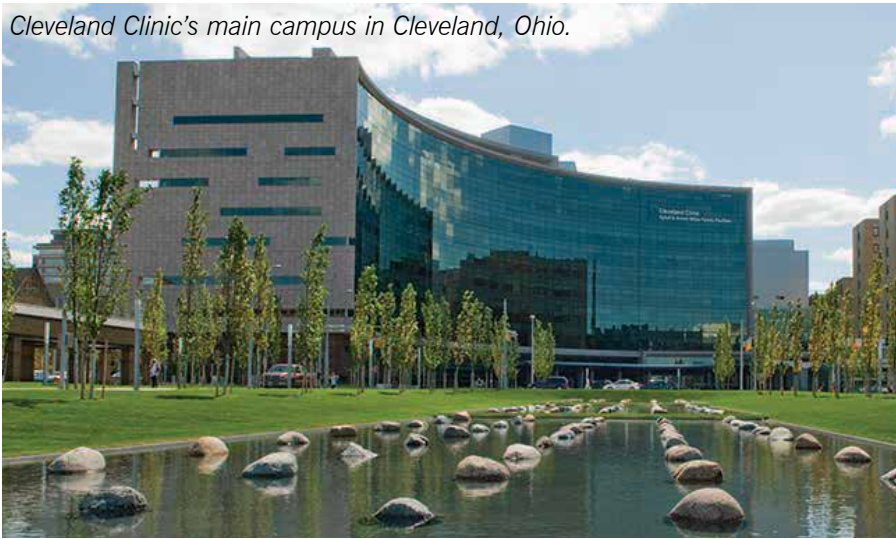
Cleveland Clinic's main campus in Cleveland, Ohio.