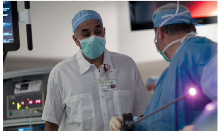
Treating and Managing Tracheobronchomalacia New procedure reduces morbidity and waiting times