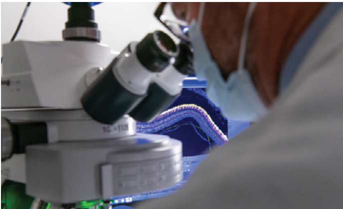
NIH Award Funds Research Training Program A research training curriculum for postdoctoral trainees