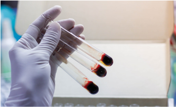
Blood Test May Identify Lung Cancers Earlier Potential to remove screening barriers